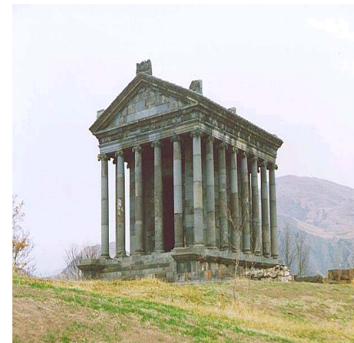
Garni, Pagan Temple, 1st century

- Tours: Garni-Geghard, Echmiadzin and Lake Sevan